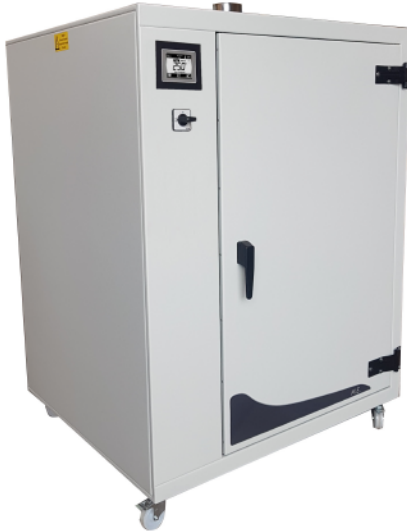
Model Shown - ME/500/TDIG