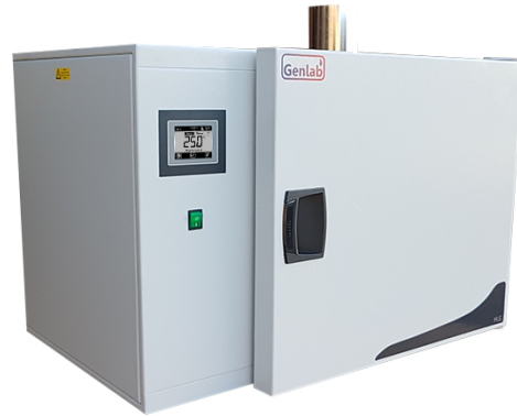
Model Shown - ME/100/TDIG

The Genlab range of Moisture Extraction Ovens are specifically designed to provide rapid drying and removal of excess moisture. Increased air circulation around the chamber and larger extraction vents offers superior drying times.